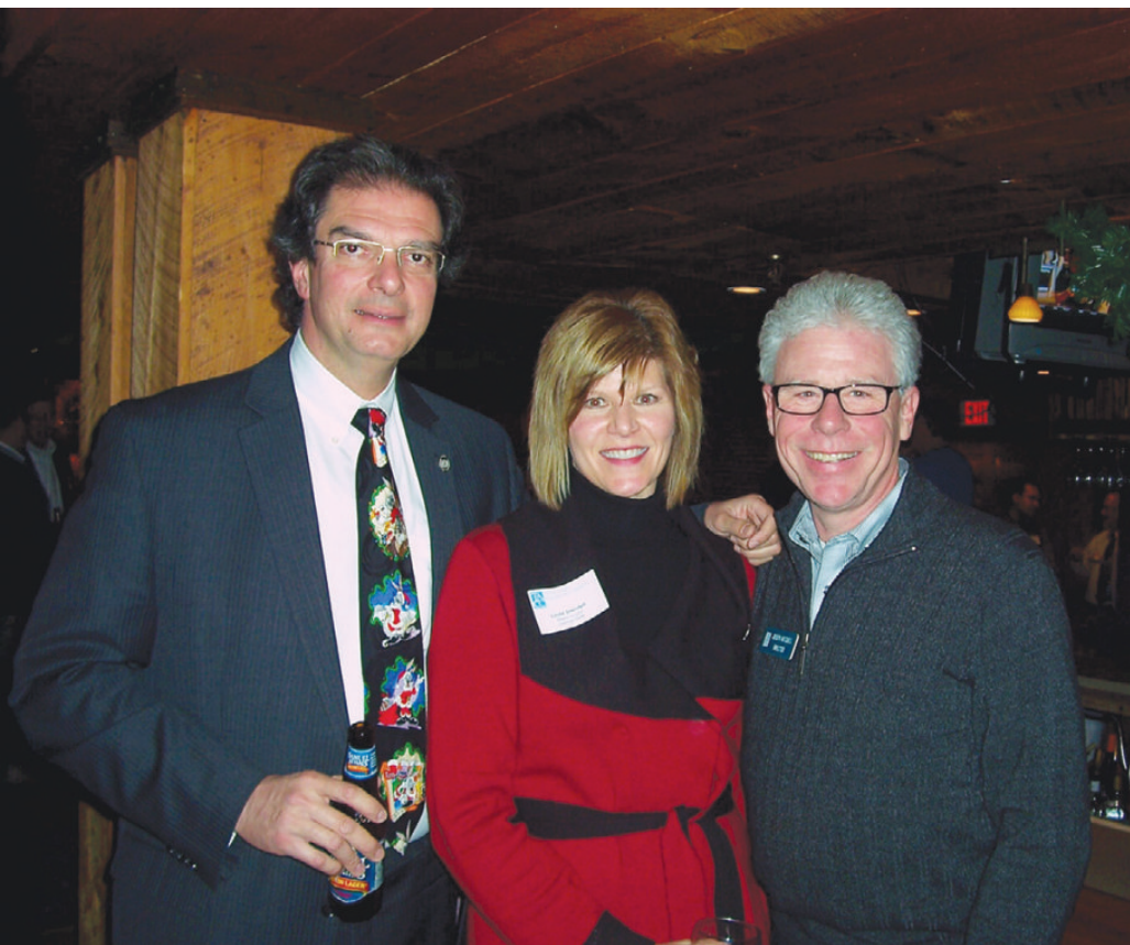
Taunton Area Chamber of Commerce members enjoy last year's holiday gathering.